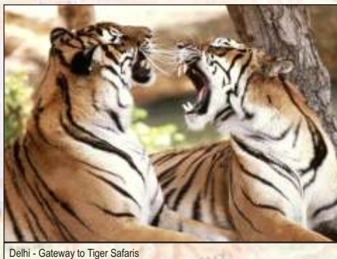
Delhi - Gateway to Tiger Safaris

The 10th Anniversary Celebrations at StAR will culminate with the conference which is followed immediately from Feb 5 to 10 by Plastindia 2015.