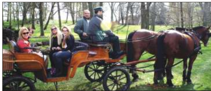
Horse &amp; carriage !

restaurant, horse & carriage stables, vineyards & more. The two day program consisted of rotomoulding related technical & business presentations; a table-tops exhibition; workshop and Q&A session; a gala dinner on the first evening with an