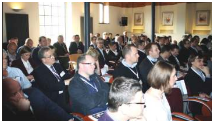
The Conference – Full House

The conference was held, April 10 & 11, at the Palac Mierzein a wellness and wine resort approx. two hour drive from Poznan, Poland. Originally built in early 1900s it is very nicely renovated hotel & resort; includes conference center, bowling club, pub -