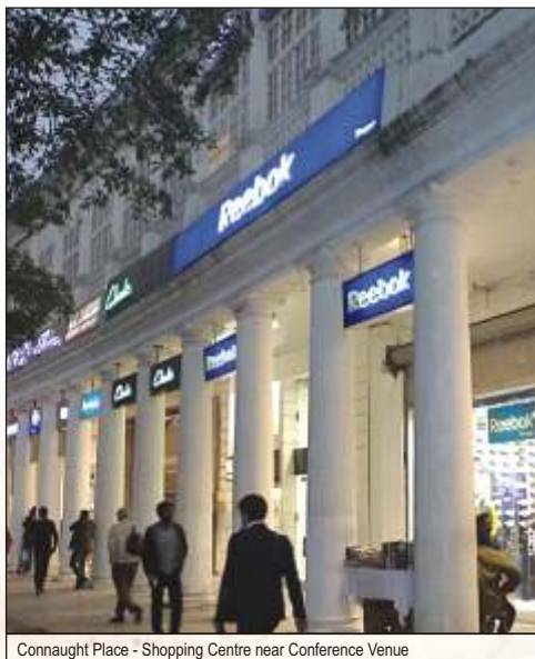
Connaught Place - Shopping Centre near Conference Venue

Significance of StAR 2015 Annual Conference on Feb 2 to 4 has increased for two reasons.