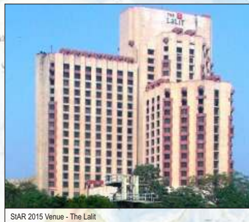
StAR 2015 Venue - The Lalit