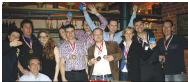
Winners – Bowling tournament

The conference was held, April 10 & 11, at the Palac Mierzein a wellness and wine resort approx. two hour drive from Poznan, Poland. Originally built in early 1900s it is very nicely renovated hotel & resort; includes conference center, bowling club, pub -